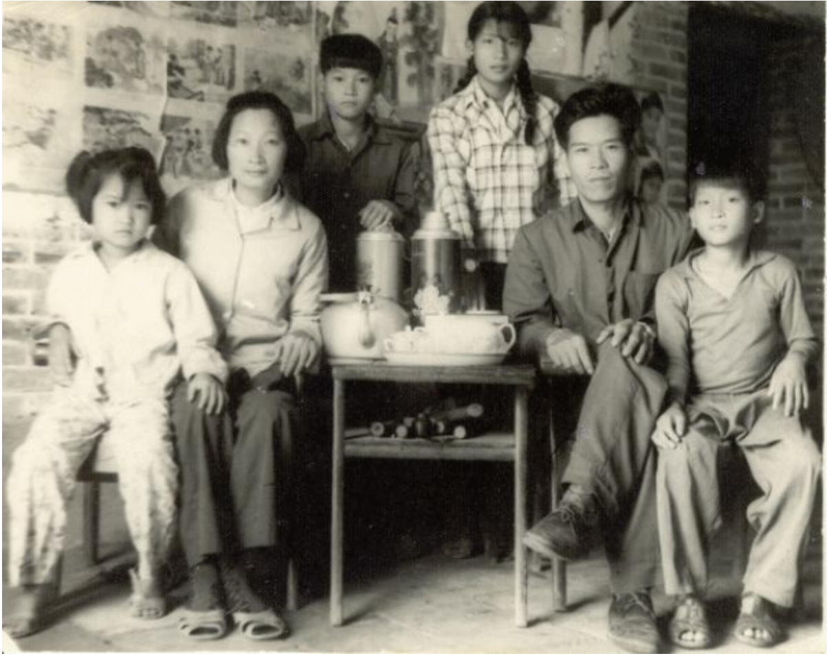
My first family picture taken in 1983. I'm the boy standing in the back.