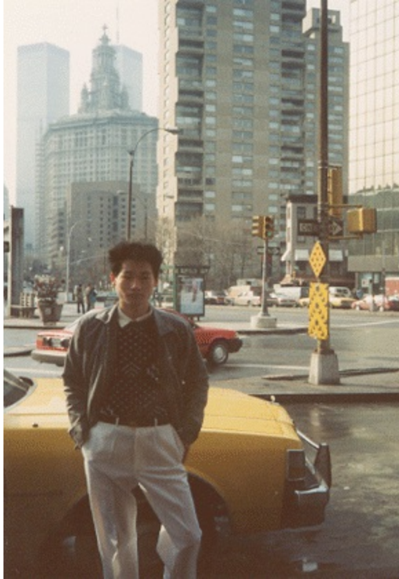
New York City. I spoke no English when I came to America.